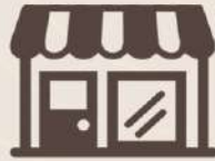
SURROUNDED BY HOUSES & SHOPS