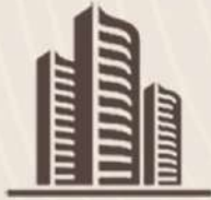
READY FOR CONSTRUCTION