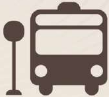
BUS STOPS & TERMINUS