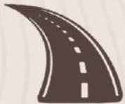
BLACK THAR ROAD