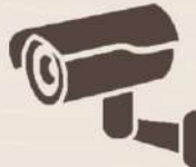
CCTV & SECURITY