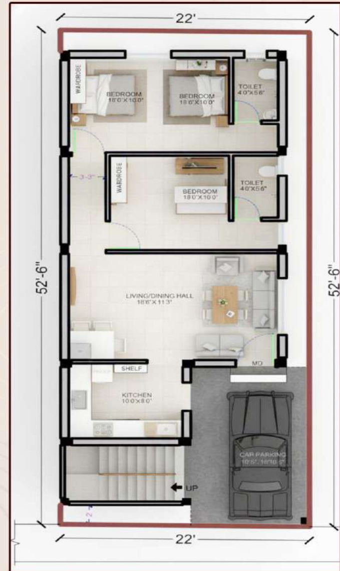
3D TOP VIEW VILLA

FULLY CUSTOMIZED VILLAS, VILLA ELEVATION MAY CHANGE DEPEND ON CLIENTS REQUIREMENT