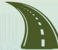
BROAD CONCRETE ROADS