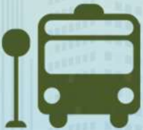
EASILY ACCESSIBLE VIA RAIL, METRO & ROADS