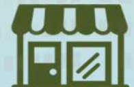
SORROUNDED HOUSE & SHOPS