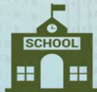
SCHOOLS, COLLEGES, HOSPITALS, SPIRITUAL PLACES, & ENTERTAINMENT ZONES NEARBY