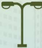
3 PHASE EB & STREET LIGHTS