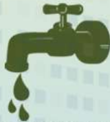
SWEET GROUND WATER