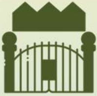
FULLY RESIDENTIAL GATED COMMUNITY