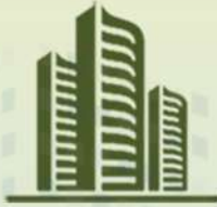
READY FOR CONSTRUCTION